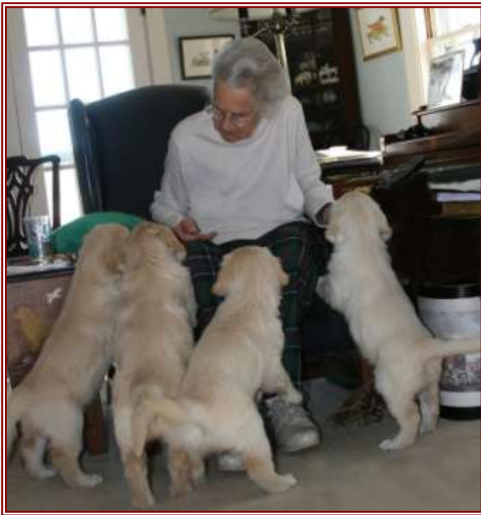
Evaluating a litter in February 2009.

room. He said that once there was a Connemara pony on the couch having sherry! While that never happened, the ponies were allowed into the laundry at the end of the house on occasion.